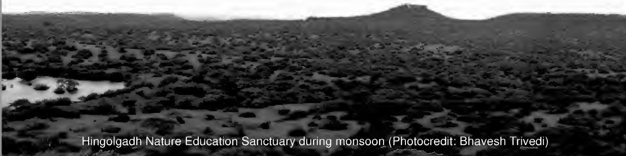
Hingolghadh Nature Education Sanctuary during monsoon